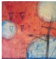
Cover 1 Redux , 12" x 12" Collage, Oil & Encaustic

Her artist's statement reads as follows: "I've always been fascinated by tornadoes. The inspiration for my work comes from recurring dreams about tornadoes. Imagery such as telephone poles and houses represent shelter and safety. Trees and limbs suggest wind and chaos. This work illustrates the fragility of life. By focusing on the human need for order in the face of chaos, it serves as a reminder that life is fleeting. I was drawn to the encaustic technique because of its transparency and luminosity. I'm intrigued by the texture, color, and the interesting play of transparency and opacity." Wood's curriculum vita lists several publications with titles on stormy weather and finding calm after a storm. Her paintings have been featured in solo, group, and juried exhibitions throughout the United States. The following galleries currently represent her work: Koelsch Gallery, Houston, Texas; AMP Gallery, Ft. Worth, Texas; Ernden Gallery, Provincetown, Massachusetts; and Town Center Fine Art, Watkinsville, Georgia.