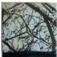
Take Shelter 4 , 12" x 12" Collage, Oil & Encaustic

She teaches encaustic painting and bookmaking workshops at her studio and other locations around the metroplex. She has collaborated with several artists on projects such as the Day of the Dead show at the Icehouse Cultural Center in Dallas, and with Trayc Claybrook in a show called Waxy Buildup .