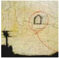
Boundary , 12" x 12" Collage, Oil & Encaustic

Deanna Wood's work was recently on display in November - December of 2007 at the Barnes & Noble Booksellers Cafe' in Denton. This venue is one of many that have featured her paintings using the encaustic technique. Encaustic involves melting beeswax and a natural resin to create a wax medium. Wood's method involves brushing on multiple layers of hot