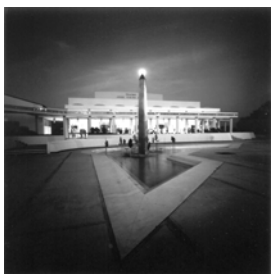
Teatro Jose Nieto, Universidad de Celaya Celaya, Mexico, 1995