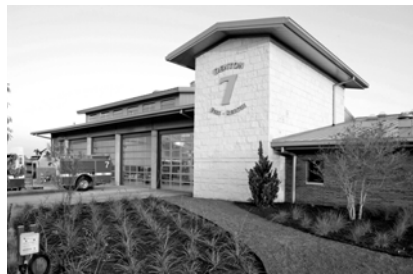
City of Denton's Fire Station Number 7 Denton, Texas, 2007