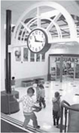
Ginnings Elementary School Denton, Texas, 2001