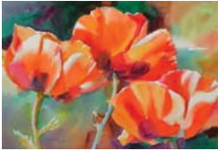
Poppies, watercolor, 2004