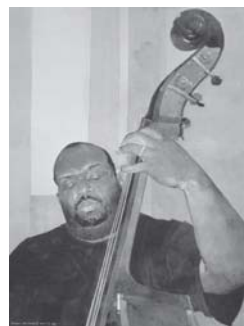
Bass, watercolor, 23"x17"

We are proud of the tradition we are creating with our VAST annual gala fundraisers. It is an evening that truly fills all the senses, and this year's January 18 gala is aptly called Sights, Sounds, and Sustenance for the Soul .