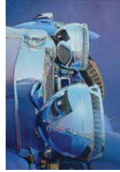
Her Royal Majesty