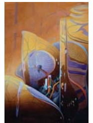
Golden Oldie #2