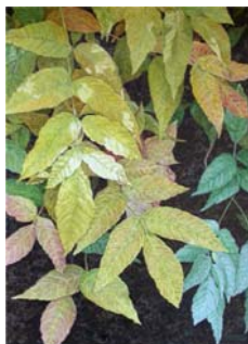
Mexican Buckeye in the Fall

As a child I loved to draw and would spend hours with my school pencil, colored pencils, crayons, typing paper, and construction paper, the only art supplies available to me. A freshman year at college brought the standard drawing and design courses with all sorts of new media and techniques. Then I married and worked while my husband attended college and dental school. I did attend some night art classes at the University of Washington. However, I had more opportunities to look at art in galleries and museums than I had to create it.