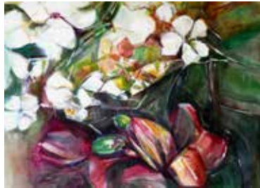
Lynne Buchanan, Arlington Altered Harmony watercolor on paper 15" x 21"