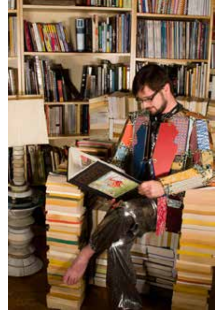
Information Consumption from Ancient Art-i-facts of the Early 21st Century installation