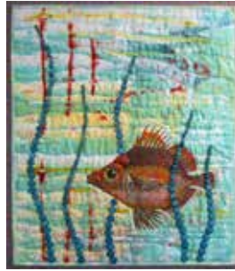
Tonya Littmann, Denton Red Fish fiber 19.5" x 17"