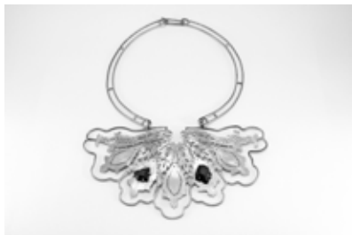
Erin Cora Turner, Denton Steel & Lace Necklace pewter, steel & sterling silver 11" x 6" x 5"