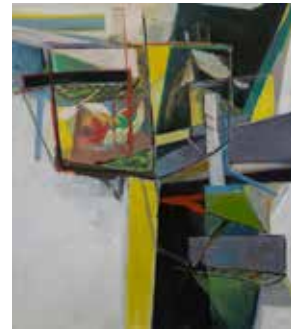
Ty Bishop, Denton Incessant Search oil on canvas 48" x 42"