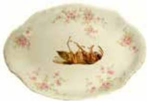
Heather Ross, Denton Untitled #3 photo transfer on vintage plate 13" x 10"