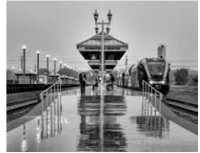
Lily Mirsky, Savannah Rainy Diptych photograph 11" x 14"