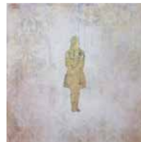
Deanna Wood, Denton Emerging oil 12" x 12"