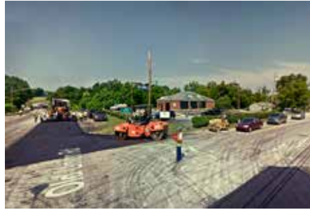
Chris Ireland, Stephenville Old Union Road archival inkjet print 12" x 18"