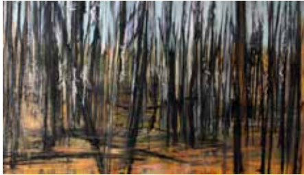
Robin Butt, Denton After Burn pastel 10" x 21"