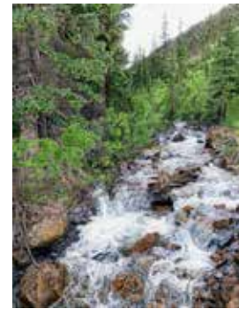
Noriko DeWitt, McKinney A Mountain Stream Near Guanella Pass colored pencil and white gelly-roll pen 24" x 18"