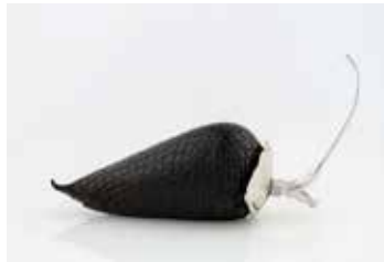
Tamar Navama, Denton Elbow Sculpture silver, alligator skin, cowhide leather 3.5" x 2.2" x 1"