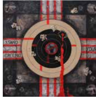
A. Eilene Carver, Frisco Lone Survivor (Florida Theater Shooting) collage, oil, acrylic 20" x 20"