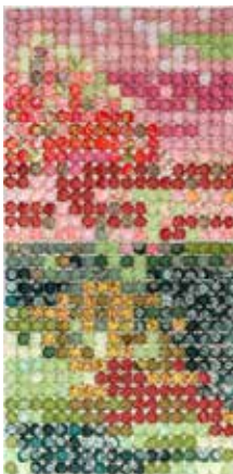
Ingrid Scobie, Denton Japanese Scroll I Japanese paper on Plexiglas 80" x 40"