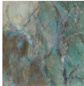
Kathy Elliott, Garland Looking Deep Within mixed media on paper 20" x 20"