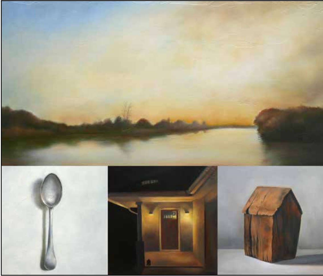
2015 VISUAL ARTS SOCIETY OF TEXAS 9th Annual 125-Mile Visual Arts Exhibition