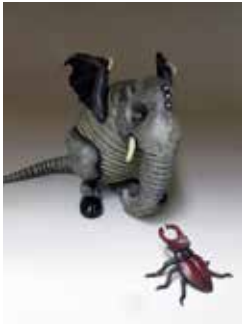
Yenphi "Mimi" Le, Denton Bevin & Toot (in 3-D) ceramics (cone 06), stains, acrylics, gloss polish, monofilament, fabric (leather), wire 8" x 18" x 8"