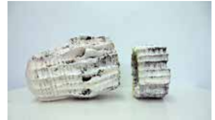
Alex Epps, Denton fabric mixed media 1" x 7"